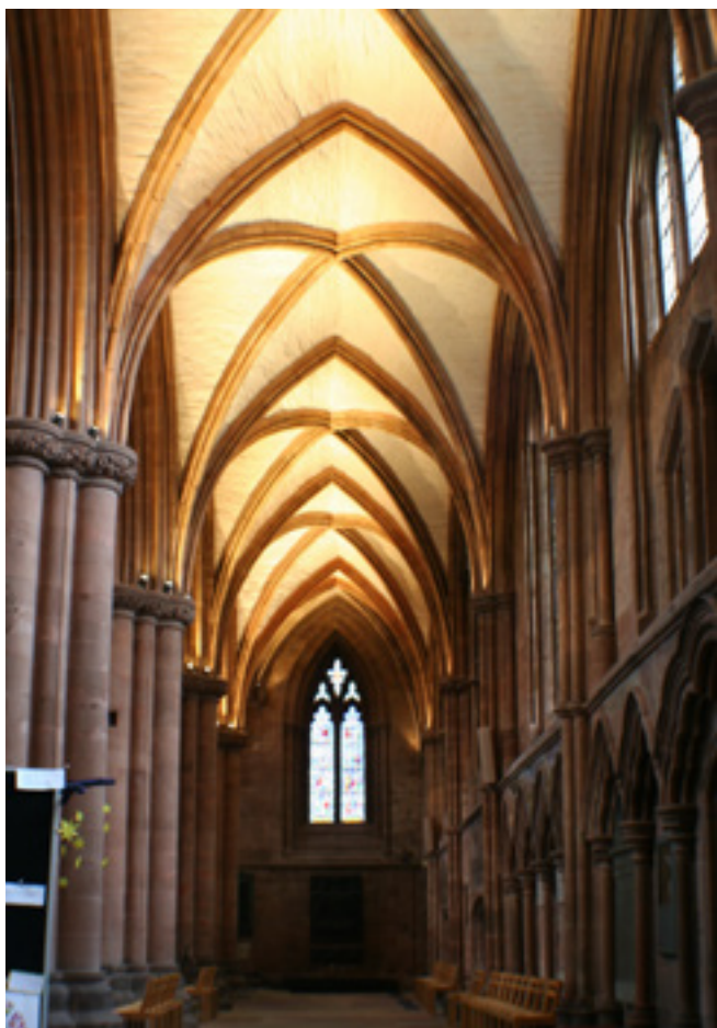
Figure 6 Carlisle Cathedral, Cumbria