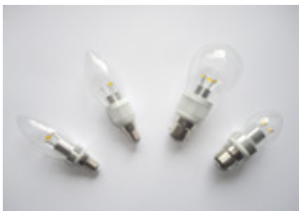
Figure 4 Examples of clear LED lamps including candles

than incandescent filaments, and with far smaller components than a fluorescent tube. Furthermore, the diode was not degraded by the process, so LEDs offered a much longer potential lifespan than any previous light source. However, LEDs had previously only been able to produce infra-red light. Holonyak's refinement was to achieve light that was visible to the human eye, and this breakthrough was hailed by his colleagues as 'the magic one'. Nevertheless, it has taken over 50 years to develop and refine this technology to deliver what we have today, credible LED light sources that are replacing many types of fluorescent, metal halide and low voltage light sources. In doing so they are bringing much reduced energy and maintenance costs.