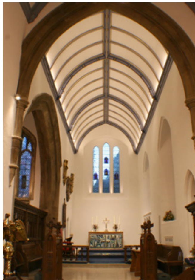
Figure 8 St Michael at the Northgate, Oxford

general downlighting or uplighting to vaulted ceilings. At Carlisle Cathedral (figure 6), for example, the choir aisles are lit entirely with LEDs and almost all of the lighting is focused upwards to illuminate the vaults, providing only reflected light for reading. The LED spotlights, being significantly smaller than equivalent low voltage fittings, are discreetly located on the column capitals and are almost unseen.