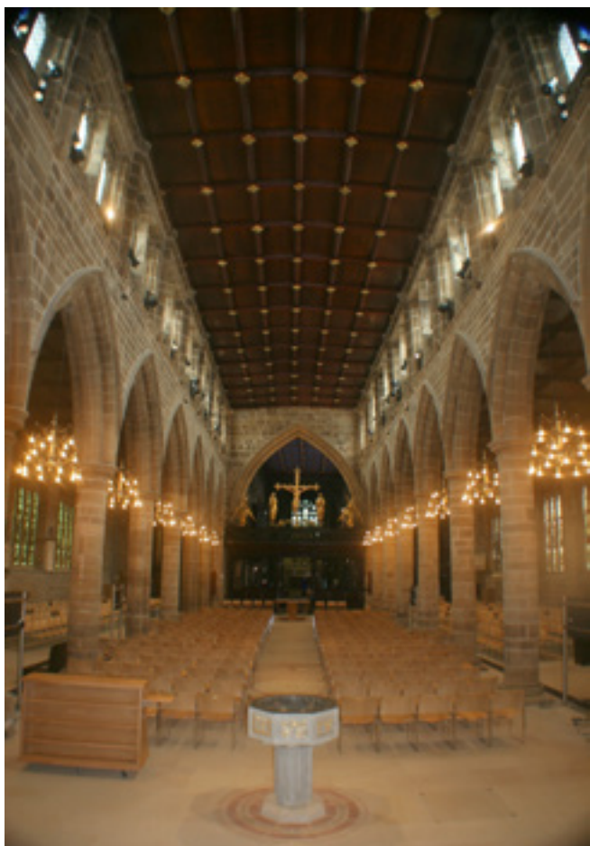
Figure 3 Wakefield Cathedral, West Yorkshire