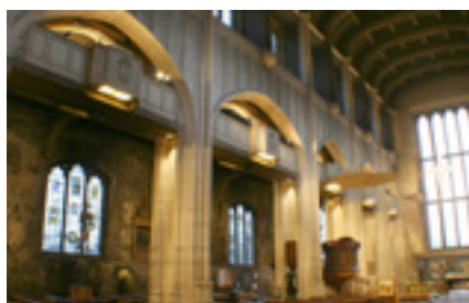
Figure 7 All Hallows by the Tower, London

The miniaturisation of light sources has been able to progress at a great rate with LED technology. This is mainly due to its energy efficiency and consequent lower heat output. In our historic churches it is now very easy to include decorative lighting elements in restricted locations such as small cornices