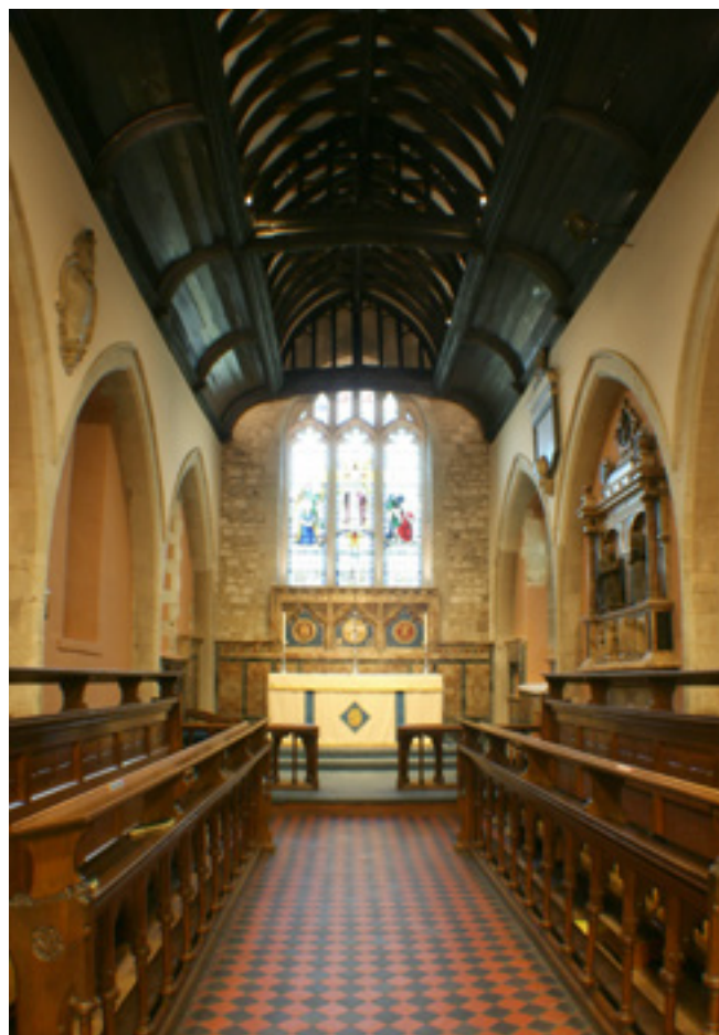
Figure 5 St Mary the Virgin, Merton, London